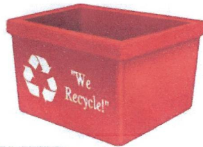
Crates & bins